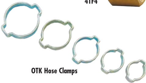
OTK Hose Clamps