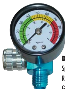
DR5 Spray Gun Regulator with Gauge