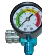
DR5 Spray Gun Regulator with Gauge