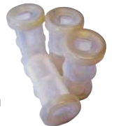
SEL.5 Spray Gun Filters