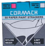
Paper Strainers PSF50/250 - Fine PSM50/250 - Medium