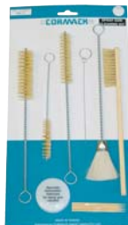
SEL.11 Spray Gun Cleaning Kit