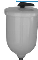
PCG.6AG 600 ml Nylon Pot