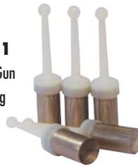
SEL.30 Paint Filters