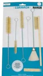
SEL.11 Spray Gun Cleaning Kit