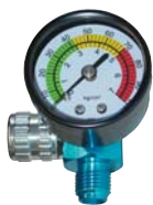
DR5 Spray Gun Regulator with Gauge