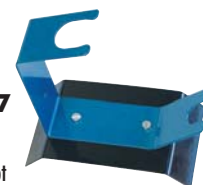
GGS Gravity Gun Stand