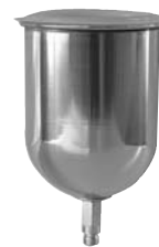
BL088057 1000 ml Aluminium pot