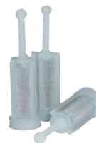
SEL.3 Paint Filters