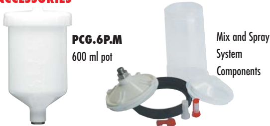
PCG.6PM 600 ml pot